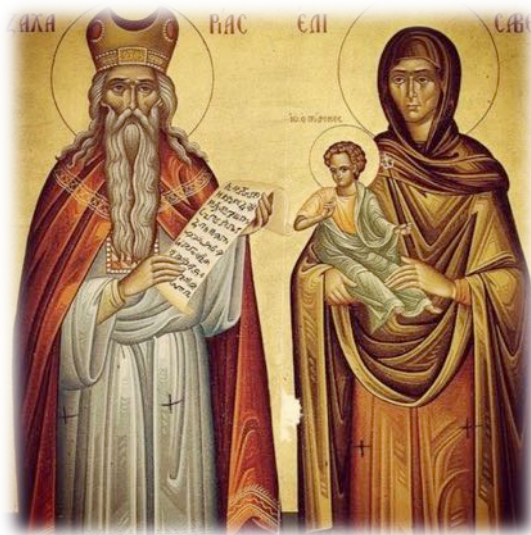
Saints Zechariah and Elizabeth with the Infant Saint John the Baptists

5 In the days of Herod, King of Judea, there was a priest named Zechariah of the priestly division of Abijah; his wife was from the daughters of Aaron, and her name was Elizabeth. 6 Both were righteous in the eyes of God, observing all the commandments and ordinances of the Lord blamelessly. 7 But they had no child, because Elizabeth was barren and both were advanced in years. 8 Once when he was serving as priest in his division's turn before God, 9 according to the practice of the priestly service, he was chosen by lot to enter the sanctuary of the Lord to burn incense. 10 Then, when the whole assembly of the people was praying outside at the hour of the incense offering, 11 the angel of the Lord appeared to him, standing at the right of the altar of incense. 12 Zechariah was troubled by what he saw, and fear came upon him. 13 But the angel said to him, "Do not be afraid, Zechariah, because your prayer has been heard. Your wife Elizabeth will bear you a son, and you shall name him John. 14 And you will have joy and gladness, and many will rejoice at his birth, 15 for he will be great in the sight of [the] Lord. He will drink neither