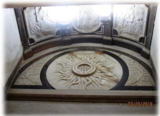
HIC PRECURSOR DOMINI NATUS EST Here Was Born the Forerunner of the Lord