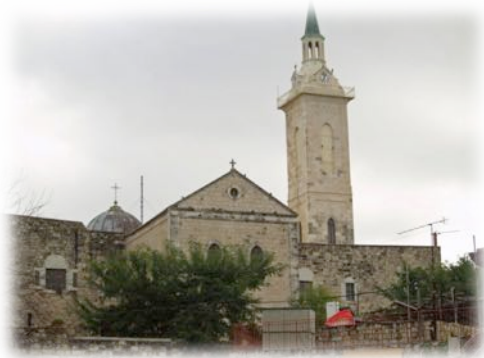
Church of Saint John the Baptist

The church was built sometime during the fourth and sixth centuries. Israelite Samaritans eventually destroyed the church during an uprising against the Byzantine Empire. When the Crusader armies defeated the Muslims they built a new Church over the site of the previous Byzantine Church during the twelfth century, but it too was destroyed when the Ottomans reconquered the region.