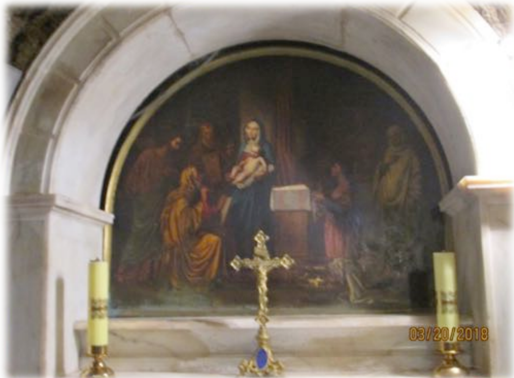
Elizabeth presenting their son, John, to Zechariah