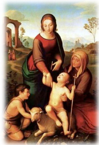
Mary And Elizabeth With Jesus And John the Baptist— Johann Fredrich Overbeck, 1825

When John was two years old, an angel comes to Elizabeth and tells her that it is safe to go to Nazareth, as Herod is now dead. So Elizabeth and John journey to Nazareth for a family reunion with Mary, Jesus, and Joseph. (from The Infancy Gospel of Saint James , and The Martyrdom of Zechariah )