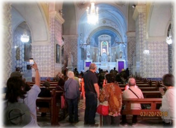
Nave and Sanctuary of the Church of St. John the Baptist Note the Spanish blue tiles on the walls and columns.