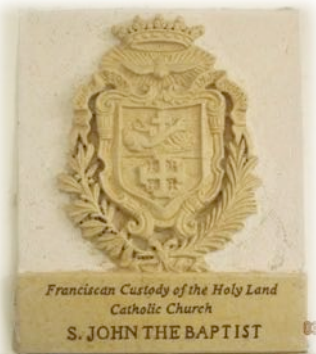
Plaque on the Church of St. John the Baptist Note the Jerusalem Cross & the arms of Christ and St. Francis

In the seventeenth century, French King Louis XIV. gained permission from the Ottoman rulers for Franciscan priests and monks to begin purchasing property in the region of Ein Kerem ; this included the ruins of both the Byzantine and Crusader churches of Saint John the Baptists. The Church's restoration began in 1674, but was not completed until 1920. The restoration of the Church of Saint John the Baptist was financed by the Royal Family of Spain as evidenced by the use of Spanish decorative tiles on the floors and walls, and artwork including what is believed to be a painting by the Spanish artist, El Greco.