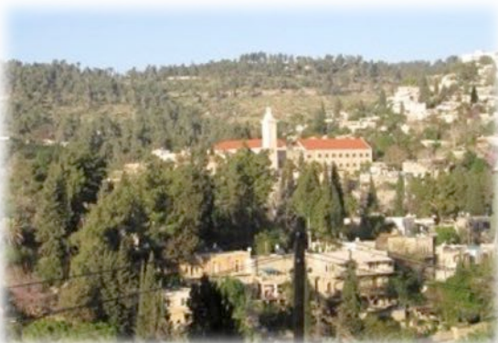
Church of Saint John the Baptist nestled in the hills of Ein Kerem

It is believed that Zechariah and Elizabeth lived in Hebron, a city of priest, in the hill country of Judea. Today, this region is called Ein Kerem , bucolic village on the western outskirts of Jerusalem. The current church, The Church of Saint John the Baptist, was built over the ruins of two earlier churches, which were also dedicated to “Forerunner of Jesus.” The first Church built by the Byzantines on the site which was believed to have been the home of Zechariah, his wife, Elizabeth, and their son,