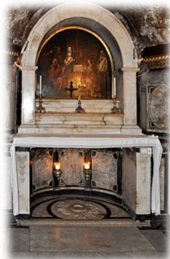
Cave and Birthplace of John the Baptist Church of John the Baptist